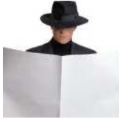
THE SPIT MANIFESTO Why LR is gung ho for Service Provider IT

A quick look at what's new, upcoming, and always useful