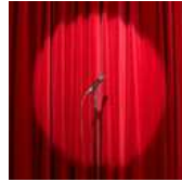
VIDEO INTERVIEW: BEN VERWAAYEN Alcatel-Lucent's CEO, in conversation