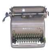
MOBILE WORLD CONGRESS: PREVIEW Data offload to the rescue