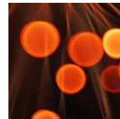
REDEFINING P-OTS Get ready for the packet/optical future