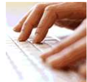
NEW PRODUCT RECAP: JAN. 2009 Can't tell the players without a program