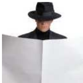
THE SPIT MANIFESTO Why LR is gung ho for Service Provider IT

Inside Light Reading A quick look at what's new, upcoming, and always useful