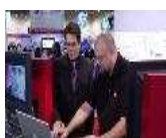
Interop Las Vegas 2010 - F5 Adds Support For VMware's vMotion Reprovisioning