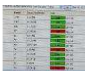
Interop Las Vegas 2010 - McAfee Next Gen Firewalls