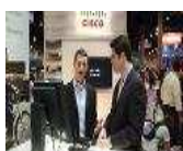
Interop Las Vegas 2010 - Cisco "Cleans"